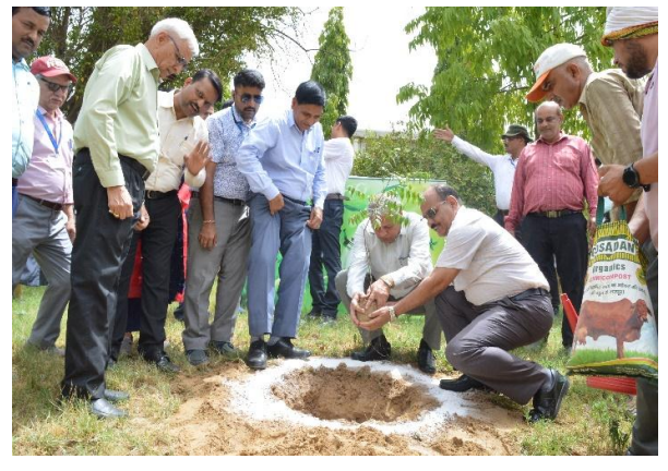
World Consumer Day