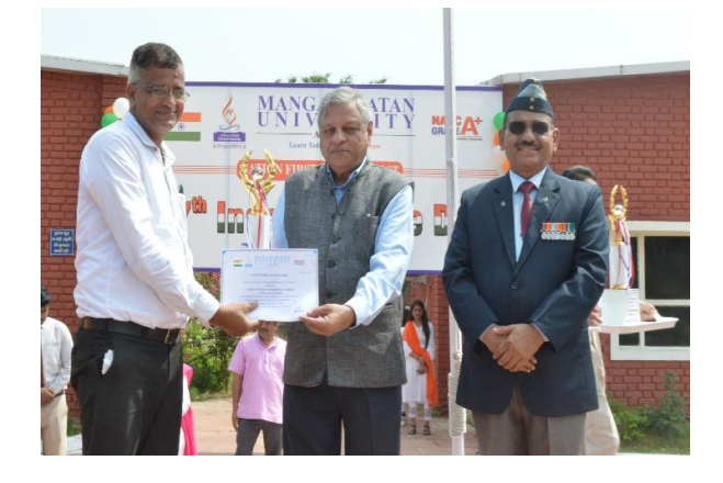
NSS (Swachhta Pakhwada)