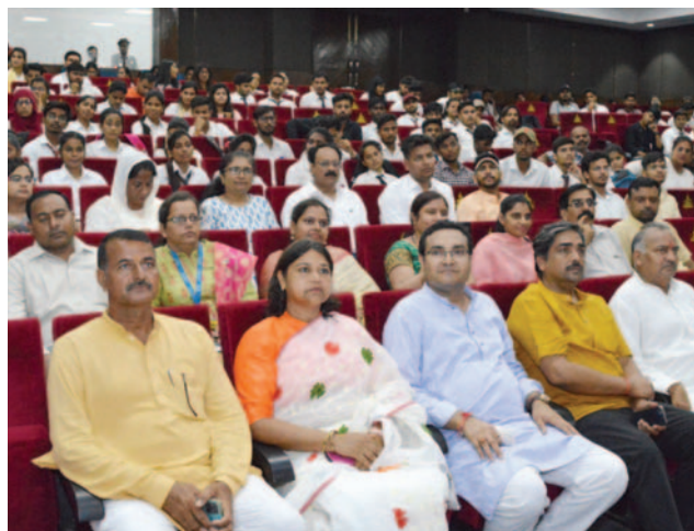
NSS (Plantation Drive)