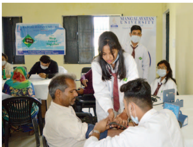
NSS (Health Camp)