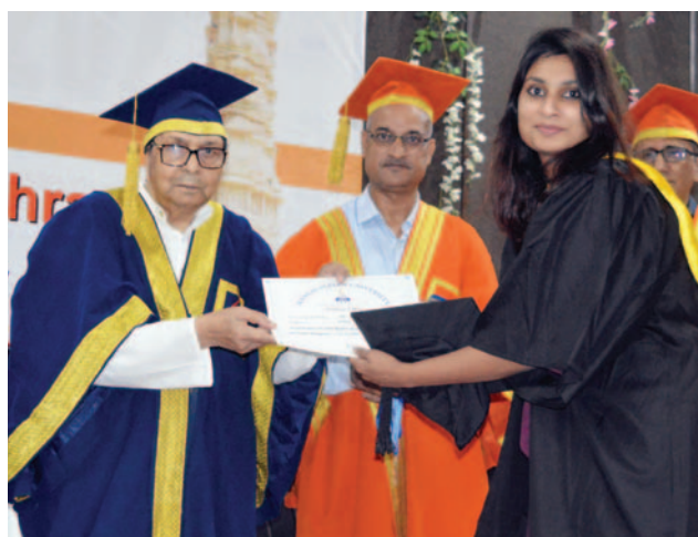
Ayurveda Day Celebration