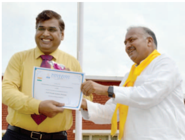
NSS (Swachhta Pakhwada)