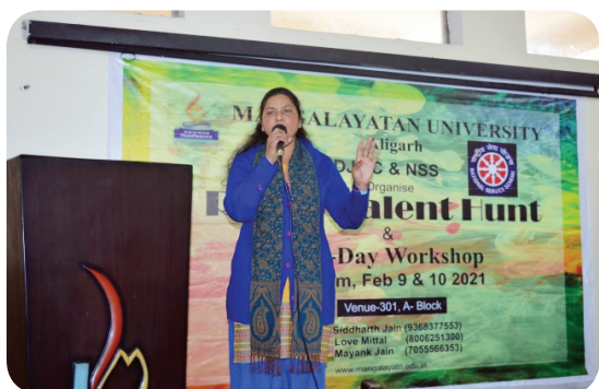
Workshop on Talent Hunt