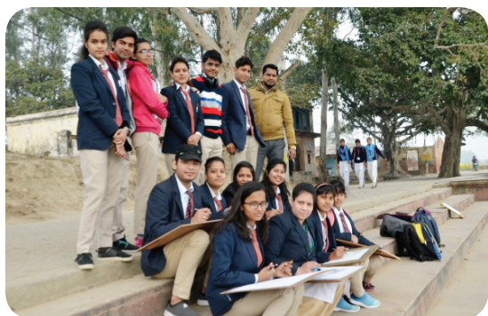
Fine Arts Educational Visit