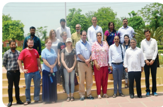
Visit of Dignitaries